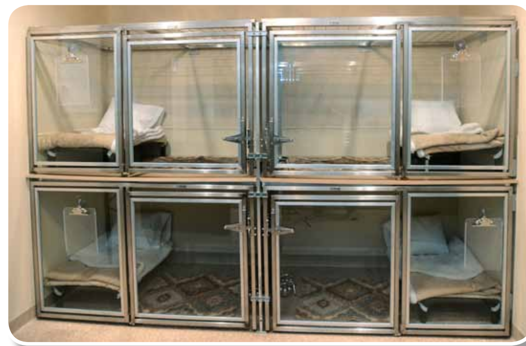
Designed by TWC Architecture and Construction